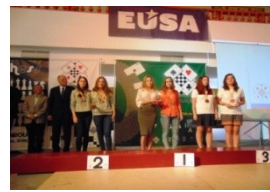
EUROPEAN UNIVERSITIES CHESS CHAMPIONSHIP 2017