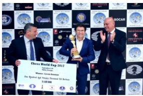
FIDE WORLD CUP 2017