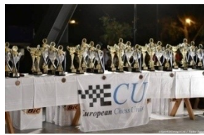
EUROPEAN YOUTH CHESS CHAMPIONSHIP 2017